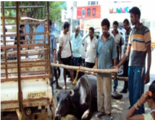
Accident buffalo brought to our shelter