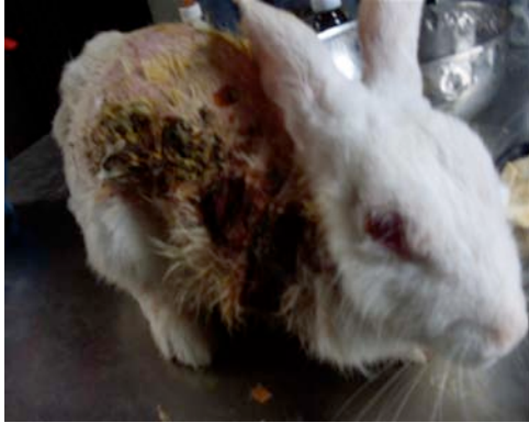
Burnt rabbit brought to our shelter for treatment