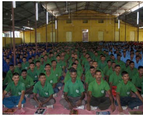
A session with the Police Cadets