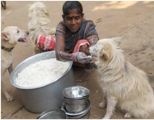
One of Animal helper feeding one of our 129 resident dogs