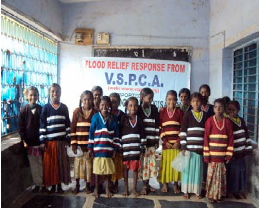
School children with sweaters provided by us