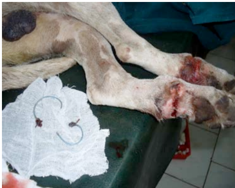
A wire being removed from leg of the dog