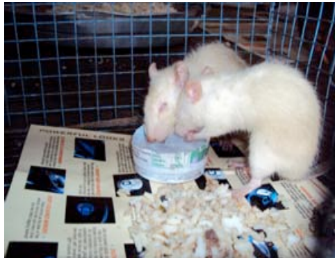
White rats rescued from slaughter place