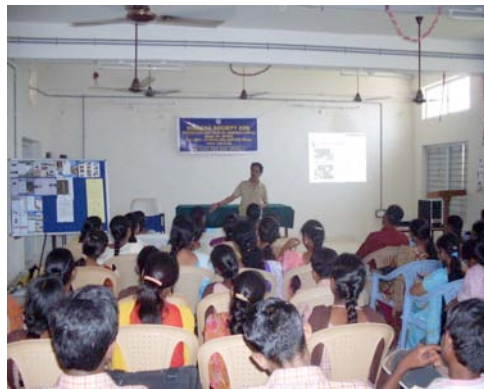
Education Campaign at School and College