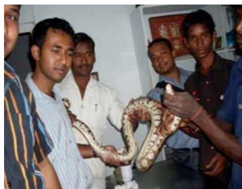
Python being treated at our shelter