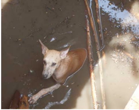
A dog being rescued from deep muddy water