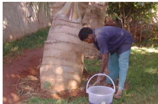
One of our Green workers at the regular plantation works