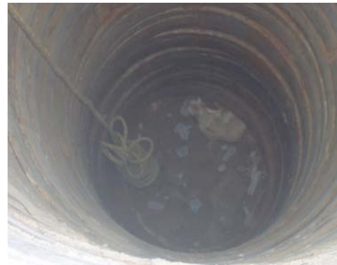
A dog being rescued from the well