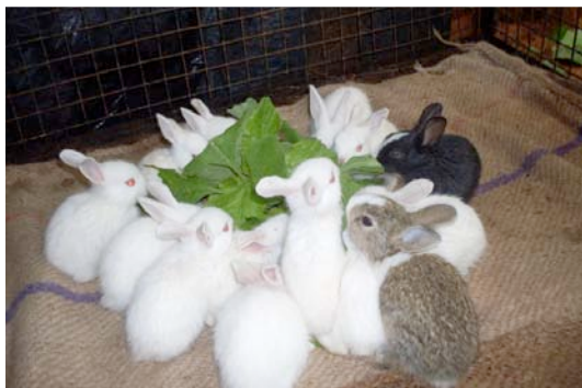
Rescued rabbits enjoying their food in their special habitat