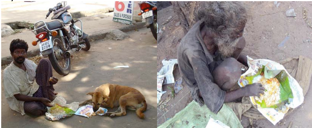
Feeding to the poor

Presently we are providing nutritious food to 40 beneficiaries three times a week and this effort will continue to improve in the coming days.