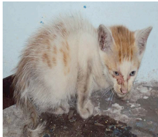
One of many rescued cats from difficult conditions