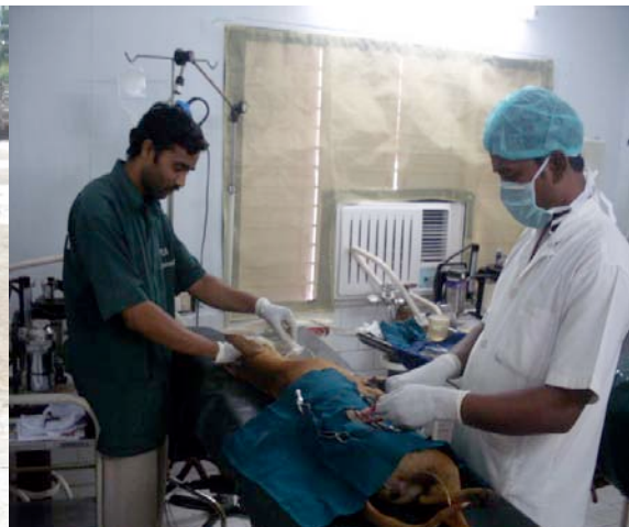
Our vets conducting Surgery