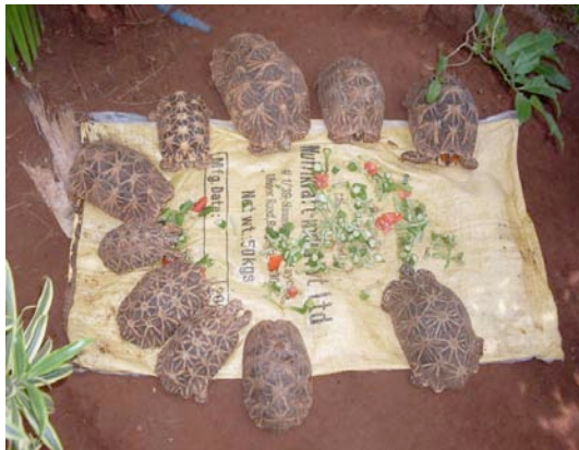
Some of our rescued Star Tortoises being fed