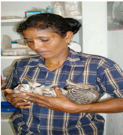
Rescued Blind kitten who will now receive our lifetime care