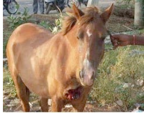
An injured and abandoned horse brought to our shelter