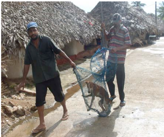
Catching of street dogs at Bheemili for ABC Program