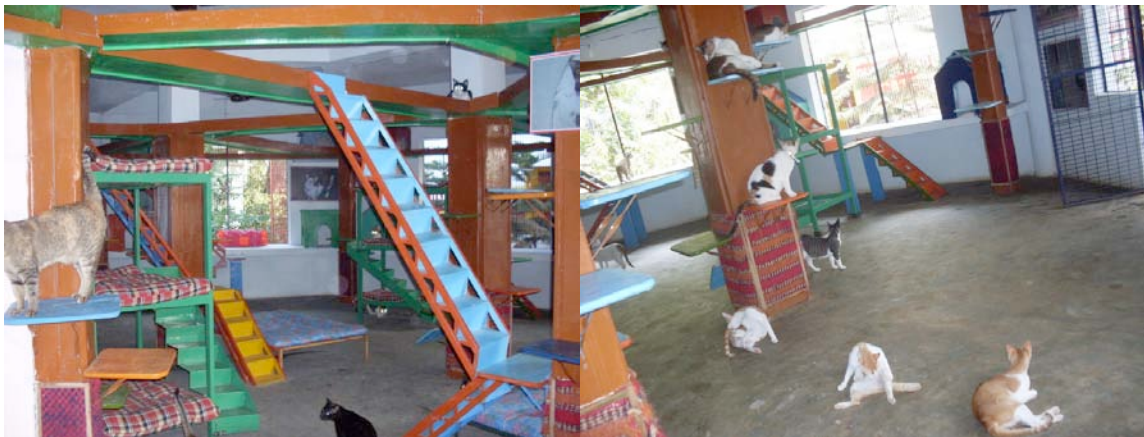
One of our three cat facilities

Also, while admitting the challenge we play a real role model to everyone concerned with the cats and their rehabilitation. Despite our limited space and resources we have been able to make a real difference for the cats by attending promptly and trying to change the mindset of the people that cats are to be valued and not to believe in the age old myths and superstitious beliefs about cats.