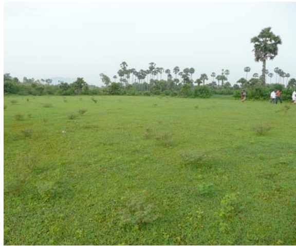
Our New land at Koruvada