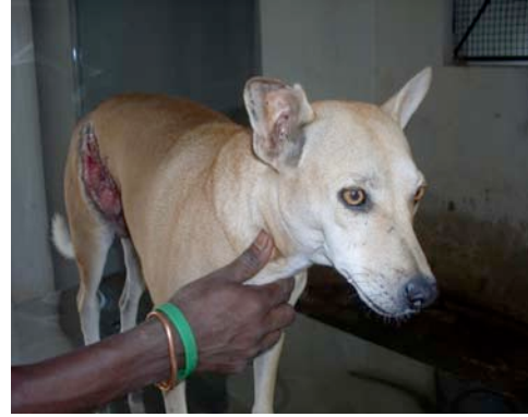
A sterilized dog brought to our shelter with a deep gash wound caused by knife thrown by the butcher.