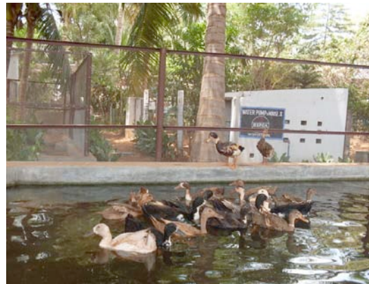
Rescued Ducks enjoying our natural habitat