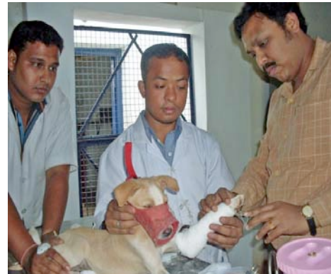
An accident puppy being treated at our hospital for