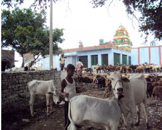
Flood Relief efforts at Kurnool