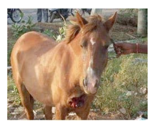
An injured and abandoned horse brought to our shelter