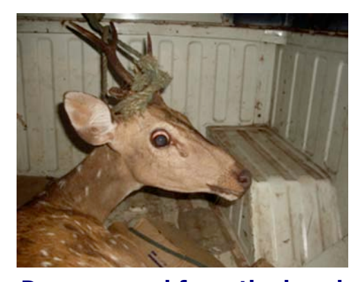
Deer rescued from the beach