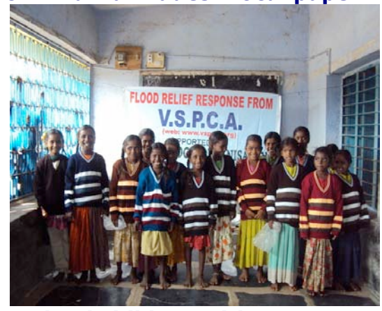
School children with sweaters provided by us