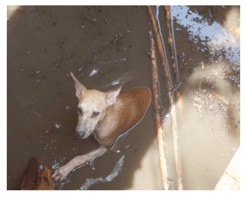
A dog being rescued from deep muddy water