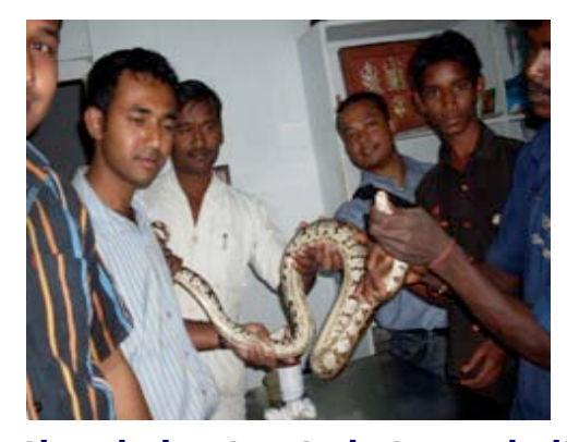
Python being treated at our shelter