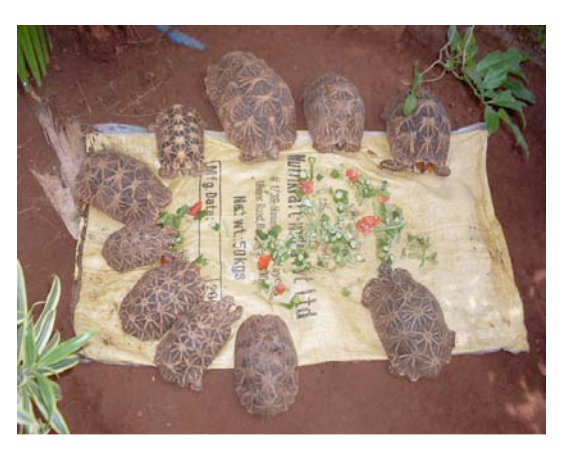
Some of our rescued Star Tortoises being fed