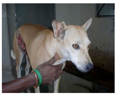
A sterilized dog brought to our shelter with a deep gash wound caused by knife thrown by the butcher.