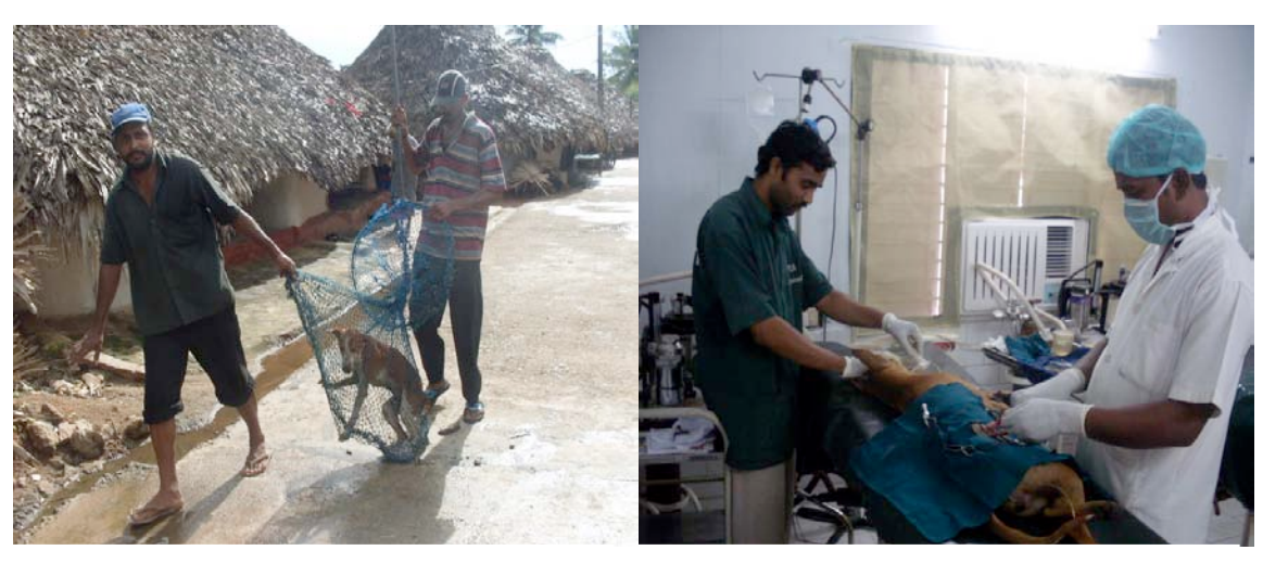
Catching of street dogs at Bheemili for ABC Program