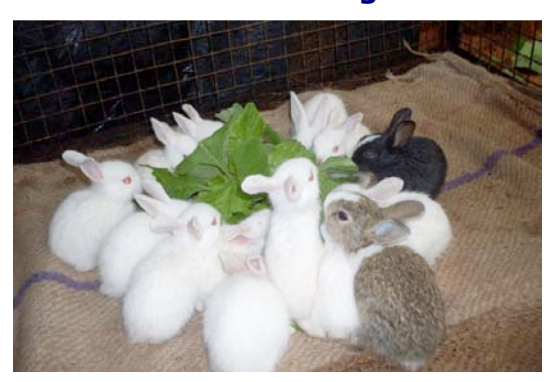
Rescued rabbits enjoying their food in their special habitat