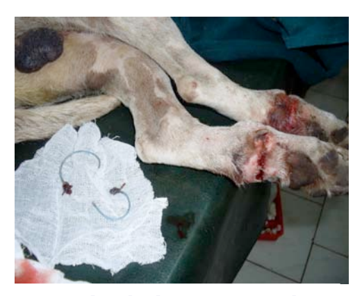
A wire being removed from leg of the dog