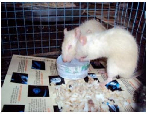
White rats rescued from slaughter place