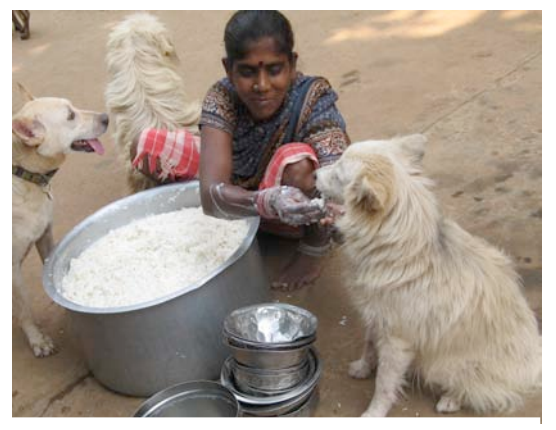
One of Animal helper feeding one of our 129 resident dogs