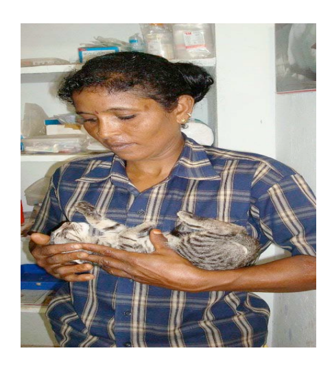
Rescued Blind kitten who will now receive our lifetime care