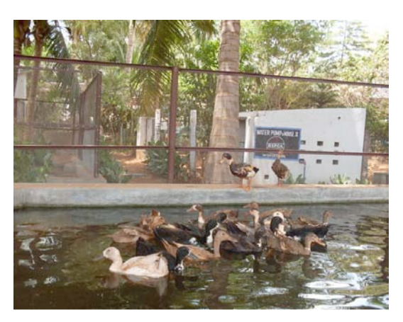
Rescued Ducks enjoying our natural habitat