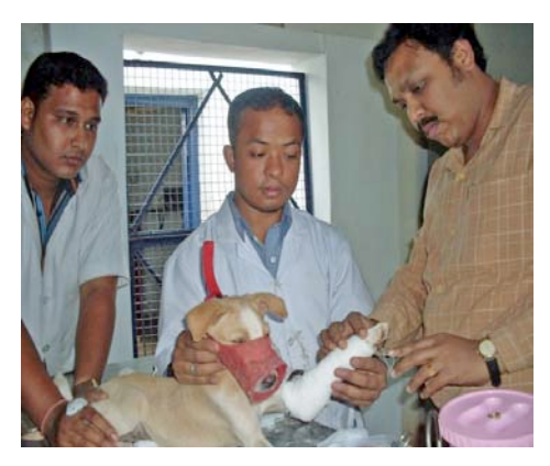
An accident puppy being treated at our hospital for