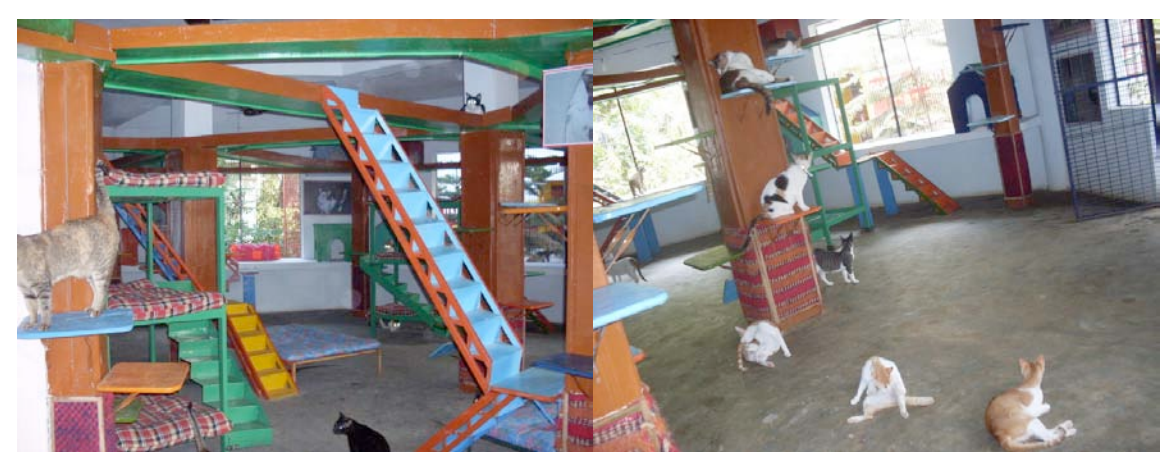
One of our three cat facilities

Also, while admitting the challenge we play a real role model to everyone concerned with the cats and their rehabilitation. Despite our limited space and resources we have been able to make a real difference for the cats by attending promptly and trying to change the mindset of the people that cats are to be valued and not to believe in the age old myths and superstitious beliefs about cats.