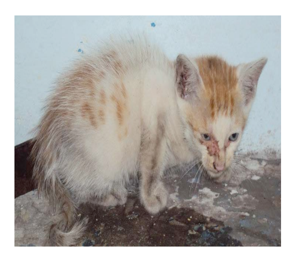
One of many rescued cats from difficult conditions