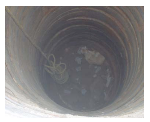
A dog being rescued from the well