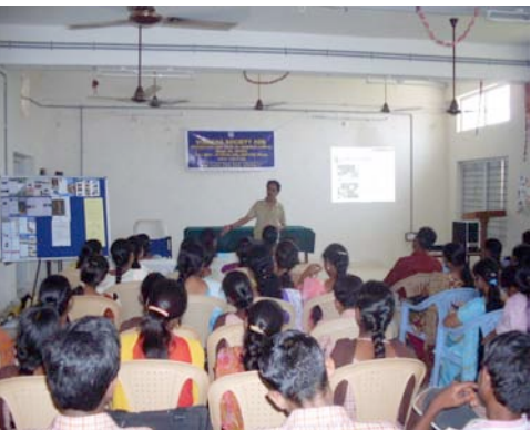
Education Campaign at School and College NATURAL DISASTER PREPAREDNESS & FLOOD RELIEF CAMPAIGN:

Considering the large number of destruction before, during and after any natural disaster the consequences to the animals who suffer the most and where there is no proper strategy planned for the street animals and known as the ownerless animals, we feel that our immediate attention should go out to them.