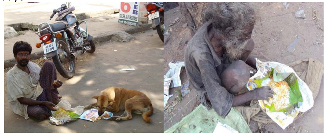
Feeding to the poor

Presently we are providing nutritious food to 40 beneficiaries three times a week and this effort will continue to improve in the coming days.