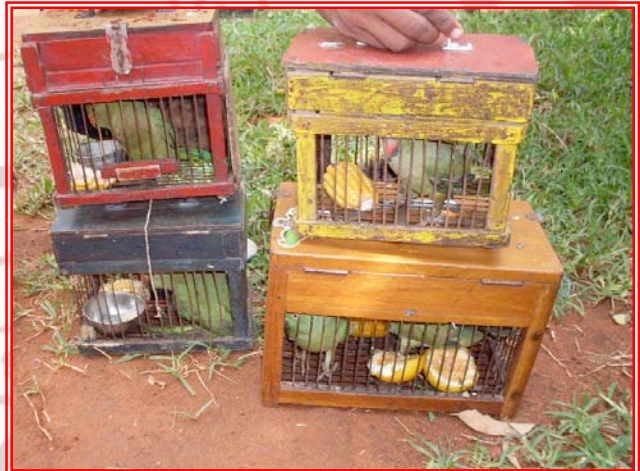
Parrot rescued from astrologers