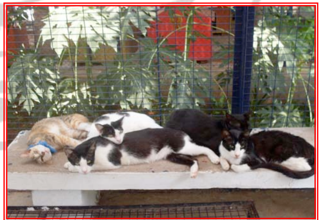
Our Cat Refuge