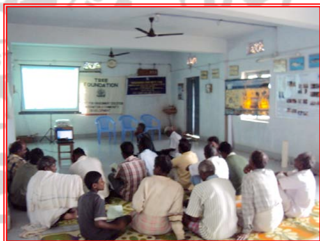
Awareness Programme at one of the Fishing Villages