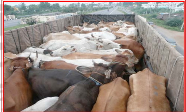
Cows Going For Slaughter Were Stopped