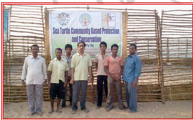
Sea Turtle Protection Force Team

Very High Tides from Tsunami day has resulted in soaking of the hatcheries and nests.