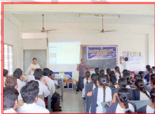
Education Programme at one of the colleges at Visakhapatnam