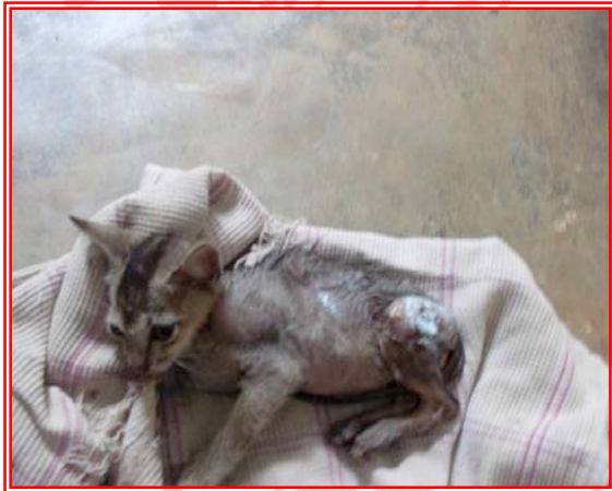
Kitten injured rescued