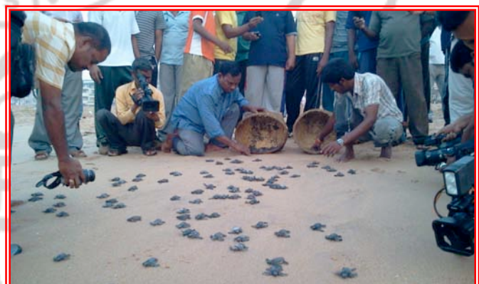
First Batch of hatchlings released by Shri. Ramalingam Zoo Curator Indira Gandhi Zoological Park, Visakhapatnam

For more details please visit the link http://www.vspca.org/programs/seaturtles .php