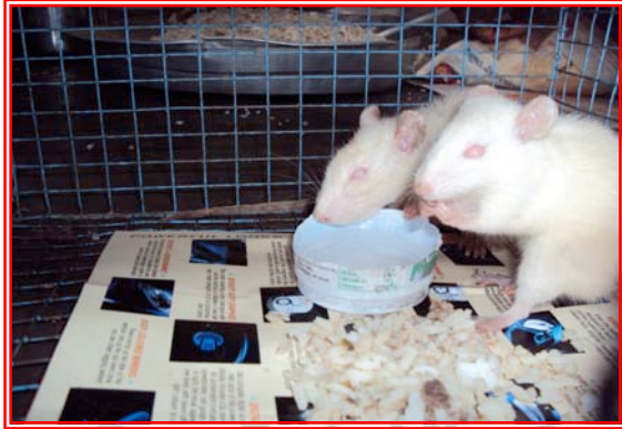
White Mice Rescued From Laboratory

As ever all our focus has been and will continue to attend to the urgent attention of rescuing any kind of animals from any difficult situation providing to the animal the best relief.