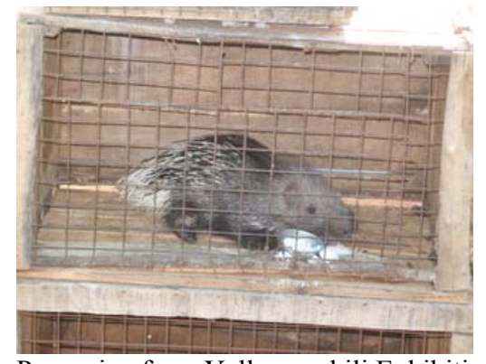
Porcupine from Yellamanchili Exhibition