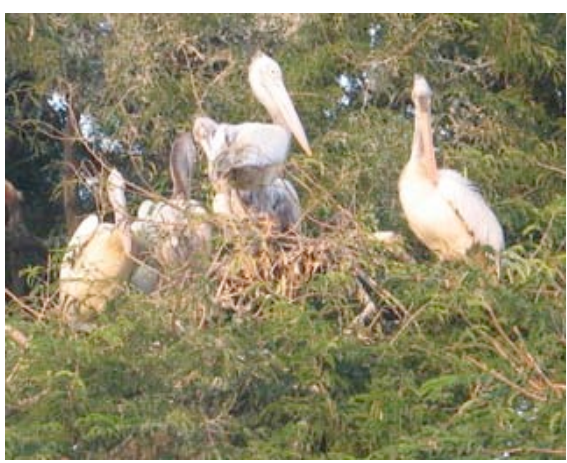
Migratory birds at Telinelipuram of Tekkali