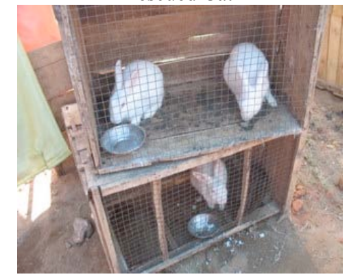
Rescued rabbits from Yellamanchili