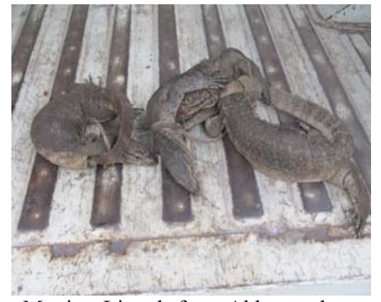
Monitor Lizards from Akkayapalem