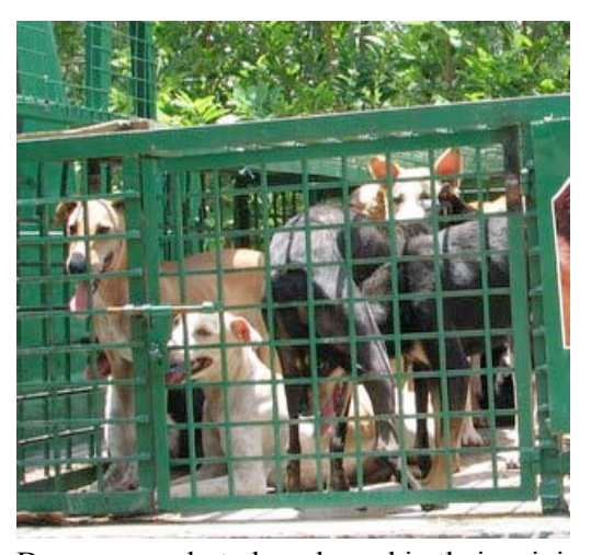
Dogs are ready to be released in their original place