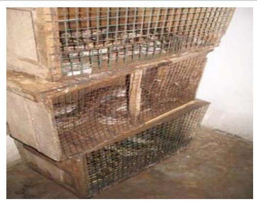
Pythons from Yellamanchili Exhibition