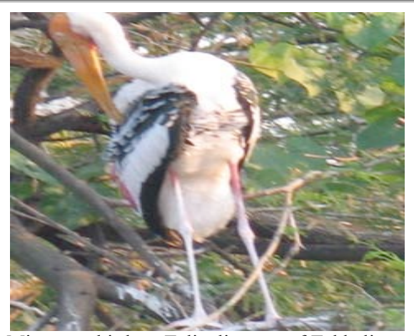
Migratory birds at Telinelipuram of Tekkali