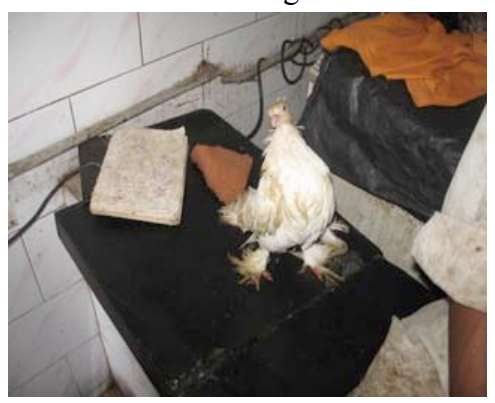
Special type of pigeon rescued from Lalithaambika Exhibition