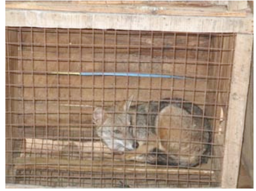
Fox from Yellamanchili Exhibition