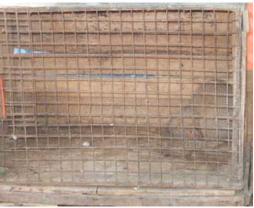
Mongoose from Yellamanchili Exhibition