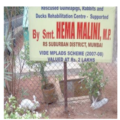
Newly constructed rehabilitation center