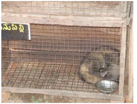
Civvies cat form Yellamanchili Exhibition