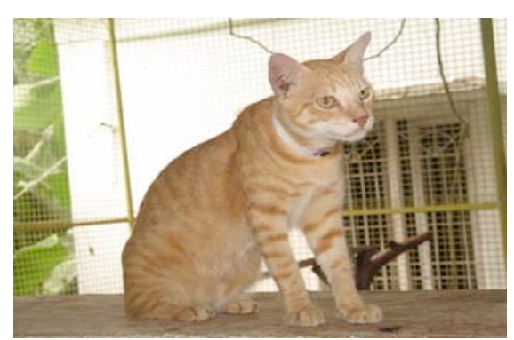
Happy Shelter Cat