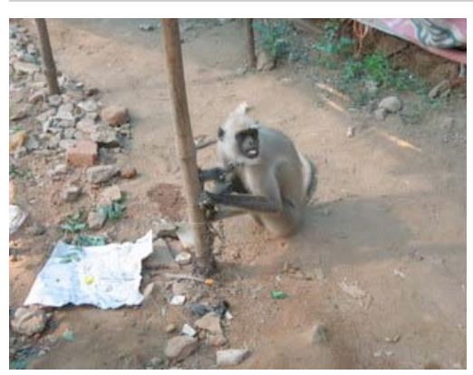
Common Langur from Yellamanchili Exhibition