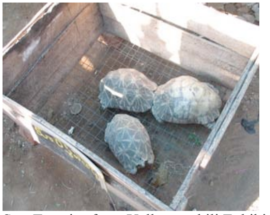
Star Tortoise from Yellamanchili Exhibition